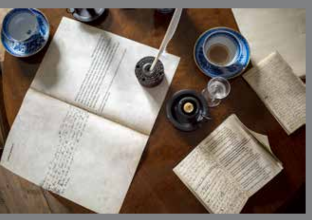
Fill your paper with the breathings of your heart.