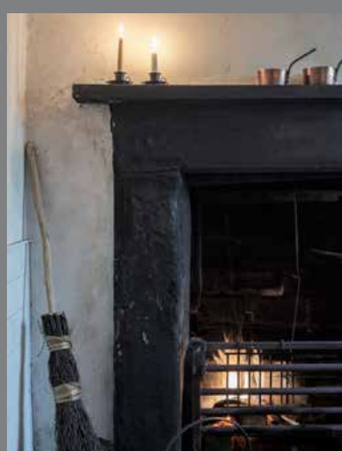
For oft when on my couch I lie In vacant or in pensive mood, They flash upon that inward eye Which is the bliss of solitude, And then my heart with pleasure fills, And dances with the Daffodls.

Now I am free, enfranchised and at large, May fix my habitation where I will. What dwelling shall receive me, in what vale Shall be my harbor, underneath what grove Shall I take up my home, and what sweet stream Shall with its murmurs lull me to rest?